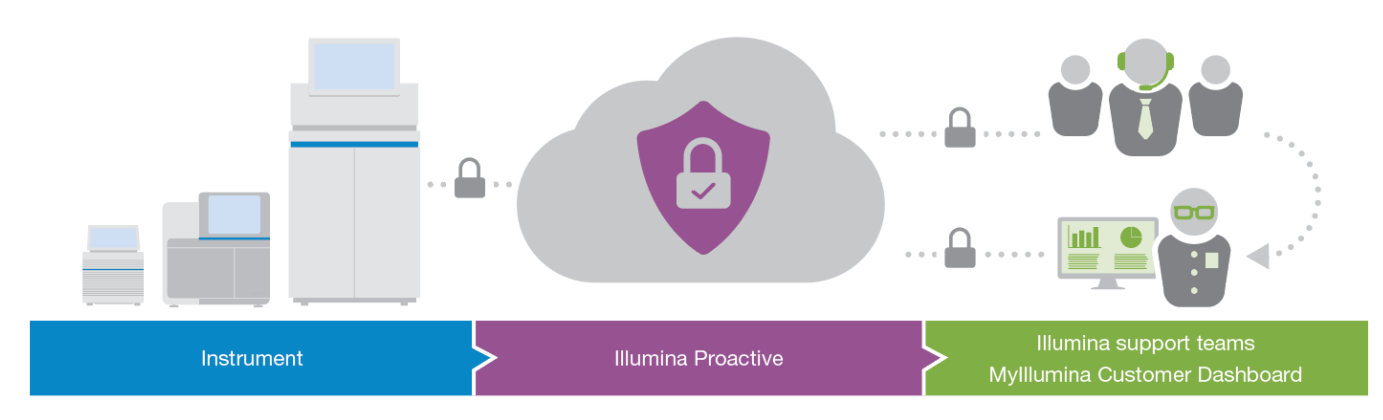
Figure 1: Illumina Proactive secure data flow—The flow of instrument performance data collected by Illumina Proactive, from the instrument to Illumina service and support teams and out to you the customer is secured through various administrative, physical and technical controls to ensure data privacy.

The Illumina Proactive instrument support service will never access genomic data (sequencing run data), personally identifiable information (PII), or protected (patient) health information (PHI) (Figure 3). Only instrument performance data, run performance data, instrument configuration data, and run configuration data, are sent by the instrument to Illumina in a secure data stream (Figure 1).