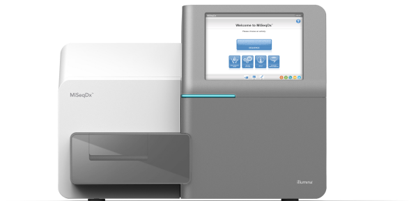
Figure 1: MiSeqDx Instrument —The FDA-regulated, CE-IVD–marked MiSeqDx instrument offers a simple workflow, a user-friendly software interface, and enhanced user security.

Compared to capillary electrophoresis-based Sanger sequencing, NGS can detect a broader range of DNA variants, including low-frequency variants and adjacent phased variants, with a faster time to result and fewer hands-on steps. 1,2 Illumina SBS chemistry employs natural competition among all four labeled nucleotides, which reduces incorporation bias and allows more robust sequencing of repetitive regions and homopolymers compared to other sequencing systems. 3 Comprehensive results are delivered quickly, eliminating the need for time-consuming reflex testing.