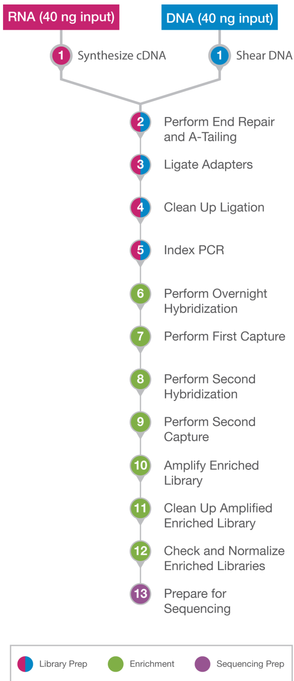
Figure 2: Combined Library Prep Workflow —The DNA and RNA samples follow the same workflow, after the cDNA synthesis step (for RNA) and the shearing step (for DNA).