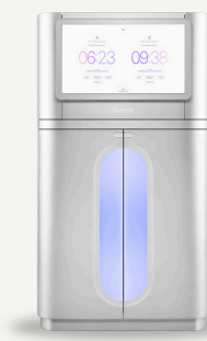
NovaSeq X Plus