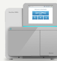
NextSeq 550Dx a,b