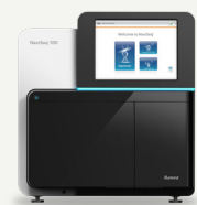
NextSeq 550 a