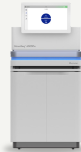
NovaSeq 6000Dx a,b