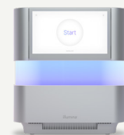
NextSeq 1000 and NextSeq 2000