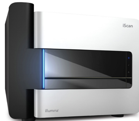
Figure 1: The iScan System —A fully automated system compatible with autoloading robotics and laboratory information management systems (LIMS) offers a robust, high-throughput scanning solution.

With a high signal-to-noise ratio, high sensitivity, a low limit of detection, and a broad dynamic range, the iScan System produces exceptional data quality for use in a wide range of biomarker screening or validation studies. The high call rates (> 99% with the Infinium Assay) enable powerful population screening studies and high-resolution CNV analysis, accurately detecting even single copy number changes. The iScan System is ideally suited for fast, accurate screening in agrigenomics or for complex disease validation studies. With sensitive measurements and a wide dynamic range, the system also offers excellent performance for methylation profiling studies.