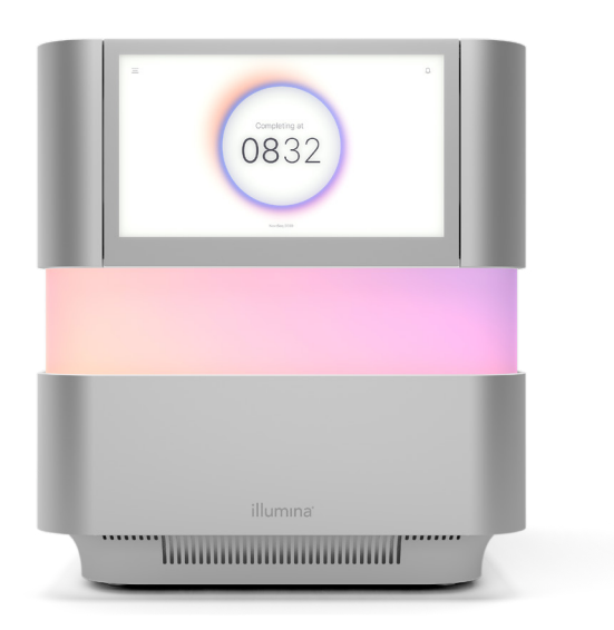
Figure 1: The NextSeq 2000 Sequencing System—The latest NGS system from Illumina offers innovative design features, advanced chemistry, simplified bioinformatics, and an intuitive workflow that enable the widest range of applications on a benchtop sequencing system.