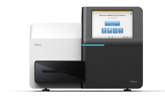
Figure 1: The MiSeq System. The VeriSeq PGS Solution leverages Illumina SBS chemistry on the MiSeq System for reliable, accurate PGS.

VeriSeq PGS relies on industry-leading Illumina sequencing by synthesis (SBS) chemistry, the most widely adopted NGS technology. In fact, 90% of the world's sequencing data are generated using Illumina technology. The proprietary reversible terminator–based method enables massively parallel sequencing of millions of DNA fragments, detecting single bases as they are incorporated into growing DNA strands. This method minimizes sequencing-related errors.