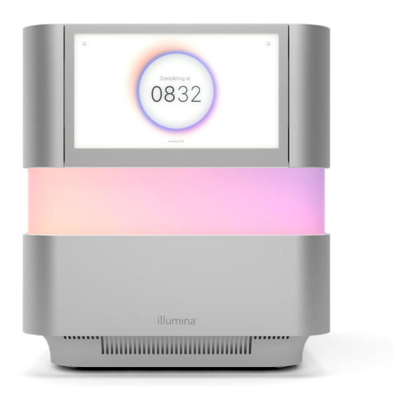
Figure 1: The NextSeq 2000 Sequencing System—The latest NGS system from Illumina offers innovative design features, advanced chemistry, simplified bioinformatics, and an intuitive workflow that enable the widest range of applications on a benchtop sequencing system.