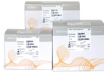
Figure 1: TruSeq Custom Amplicon Kit Dx —The FDA-regulated, CE-IVD–marked TruSeq Custom Amplicon Kit Dx provides library preparation reagents that allow clinical laboratories to develop their own diagnostic tests intended for use on Illumina Dx sequencing instruments.