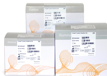
Figure 1: TruSeq Custom Amplicon Kit Dx —The FDA-regulated, CE-IVD–marked TruSeq Custom Amplicon Kit Dx provides library preparation reagents that allow clinical laboratories to develop their own diagnostic tests intended for use on Illumina Dx sequencing instruments.