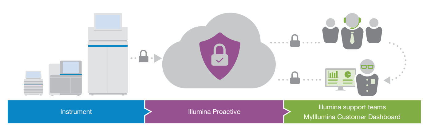
Figure 1: Illumina Proactive secure data flow—The flow of instrument performance data collected by Illumina Proactive, from the instrument to Illumina and out to you the customer is secured through various administrative, physical, and technical controls to ensure data privacy.<sup>1</sup>

The Illumina Proactive instrument support service is not able to access genomic data (sequencing run data), personally identifiable information (PII), or protected (patient) health information (PHI) (Figure 3). Only instrument performance data, run performance data, instrument configuration data, and run configuration data, are sent by the instrument to Illumina in a secure data stream (Figure 1).