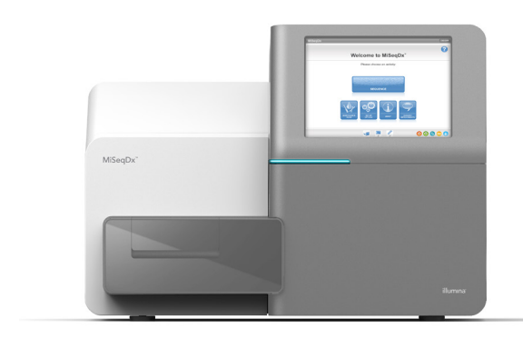
Figure 1: MiSegDx Instrument—The FDA-regulated, CE-IVDmarked MiSeqDx Instrument offers a simple workflow, userfriendly software interface, and enhanced user security.

The MiSeqDx Instrument is the first Food and Drug Administration (FDA)-regulated and Conformité Européene in vitro diagnostic (CE-IVD)-marked platform for nextgeneration sequencing (NGS) (Figure 1). Designed specifically for the clinical laboratory environment, the MiSegDx Instrument offers a small footprint (0.3 square meters), an easy-to-use workflow, and data output tailored to the diverse needs of clinical labs. In addition, the oninstrument integrated software enables run setup, sample tracking, user management, audit trails, and results interpretation.* Taking advantage of proven Illumina sequencing by synthesis (SBS) chemistry, the MiSeqDx Instrument provides accurate, reliable screening and diagnostic testing.