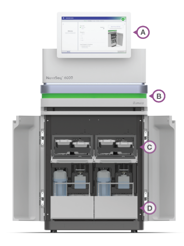
Figure 3: The NovaSeq 6000 System provides straightforward operation— Many features of the NovaSeq 6000 System are designed to simplify genomic studies, including (A) intuitive touch screen interface, (B) lighted LED display indicates flow cell status, (C) snap-in cartridges contain ready-to-use reagents, and (D) waste containers that can be easily removed for disposal.

terminator—based method enables the massively parallel sequencing of billions of DNA fragments, detecting single bases as they are incorporated into growing DNA strands. The method significantly reduces errors and missed calls associated with strings of repeated nucleotides (homopolymers).