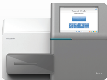
Figure 1: An Overview of the MiSeqDx Cystic Fibrosis System Workflow

The MiSeqDx Cystic Fibrosis System provides a complete molecular CF testing solution. The easy-to-use workflow with Illumina User Management Software yields high positive and negative predictive values, resulting in an efficient, cost-effective CF testing workflow (Figure 1).