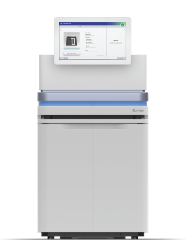
Figure 1: The NovaSeq 6000 System-Transforming sequencing by combining throughput, flexibility, and ease of use for virtually any method, genome, and

The NovaSeq 6000 System offers output up to 6 Tb and 20 B reads in < 2 days. Multiple flow cell types and read length combinations offer flexible output and run time configurations