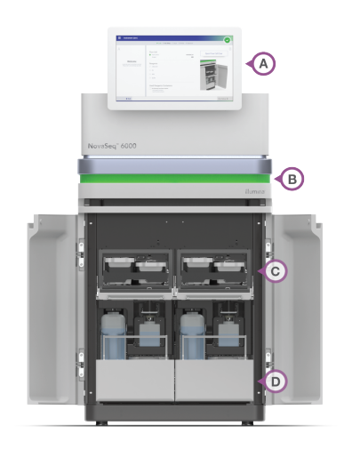
Figure 3: The NovaSeq 6000 System provides straightforward operation-Many features of the NovaSeq 6000 System are designed to simplify genomic studies, including (A) intuitive touch screen interface, (B) lighted LED display indicates flow cell status, (C) snap-in cartridges contain readyto-use reagents, and (D) waste containers that can be easily removed for disposal.

Data from the NovaSeq 6000 System can be streamed into BaseSpace Sequence Hub, a user-friendly genomics cloud computing platform optimized for processing large data volumes. BaseSpace Sequence Hub offers simplified data management,