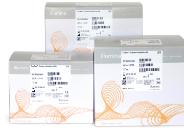
Figure 1: TruSeq Custom Amplicon Kit Dx —The FDA-regulated, CE-IVD–marked TruSeq Custom Amplicon Kit Dx provides library preparation reagents that allow clinical laboratories to develop their own diagnostic tests intended for use on Illumina Dx sequencing instruments.