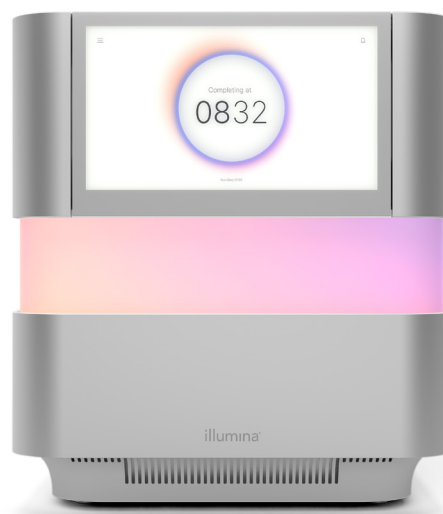
Figure 1: The NextSeq 2000 Sequencing System —The latest NGS system from Illumina offers innovative design features, advanced chemistry, simplified bioinformatics, and an intuitive workflow that enable the widest range of applications on a benchtop sequencing system.