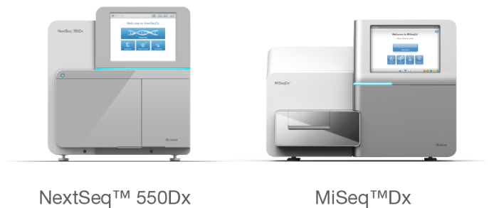
Figure 3: Illumina NGS sequencing systems portfolio —Illumina NGS systems offer solutions for a broad range of applications, sample types, and sequencing scales. Each delivers high-quality data and high accuracy with flexible throughput and simple, streamlined workflows.

The NextSeq 550Dx instrument offers fully integrated onboard analysis software with modular software architecture to support current and future assays. Instrument control software is accessed through a user-friendly touch screen interface. Local Run Manager software supports planning sequencing runs, tracking libraries and runs with audit trails, and integration with onboard data analysis modules. While Local Run Manager runs on the instrument computer, users can monitor run progress and view analysis results from other computers connected to the same network. After a sequencing run is completed, Local Run Manager automatically starts data analysis using one of the application-specific analysis modules.