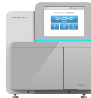
Figure 1: The NextSeq 550Dx Instrument —By leveraging the latest advances in SBS chemistry and user-friendly, regulated workflows, the NextSeq 550Dx instrument delivers high-quality results for both clinical and research applications.

At the core of the NextSeq 550Dx instrument is proven Illumina sequencing by synthesis (SBS) chemistry—the most widely adopted NGS chemistry in the world. 1 This reversible, terminator-based method detects single bases as they are incorporated into growing DNA strands and enables the parallel sequencing of millions of DNA fragments. Illumina SBS chemistry employs natural competition among all four labeled nucleotides, which reduces incorporation bias and allows more robust sequencing of repetitive regions and homopolymers. 2