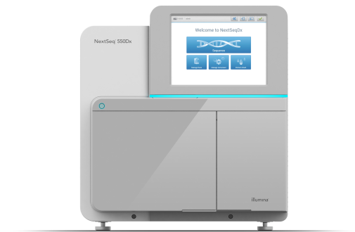
Figure 1: The NextSeq 550Dx Instrument —By leveraging the latest advances in SBS chemistry and user-friendly, regulated workflows, the NextSeq 550Dx instrument delivers high-quality results for both clinical and research applications.

At the core of the NextSeq 550Dx instrument is proven Illumina sequencing by synthesis (SBS) chemistry—the most widely adopted NGS chemistry in the world. 1 This reversible, terminator-based method detects single bases as they are incorporated into growing DNA strands and enables the parallel sequencing of millions of DNA fragments. Illumina SBS chemistry employs natural competition among all four labeled nucleotides, which reduces incorporation bias and allows more robust sequencing of repetitive regions and homopolymers. 2