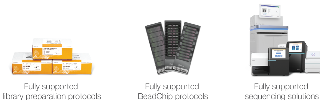
Figure 1: Illumina Workflow Design and Evaluation Services overview —The customized sample-to-data Workflow Design and Evaluation Service gives customers the flexibility to submit samples to be run on any Illumina instrument with any Illumina protocol.

For projects requiring a custom analysis solution, customers can work with a dedicated bioinformatician from our Illumina Bioinformatics Services team. Custom analysis provides an advantage for customers who are working with processes or species currently not supported through BaseSpace Sequence Hub. For custom targeted sequencing applications, sequencing panels can also be created for human and non-human species