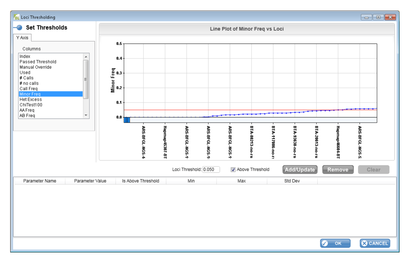
Figure 2: Automated Filtering—Users define a threshold (red line) for a particular metric (Columns list on left). Beeline Software automatically filters and eliminates any samples or loci (pictured) that do not meet the threshold from further downstream analysis.

Beeline Software also generates charts for visualizing data. Users can select charts from a list of available templates that include Call Rate vs Index and p10 GC vs Index, or customize them to suit experimental needs.