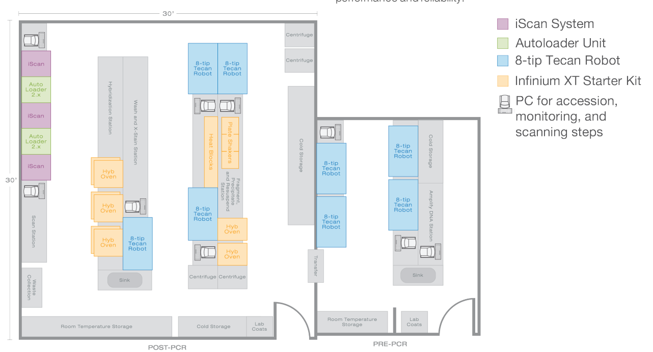
Figure 4: Example Lab Layout for Infinium XT Production-Scale Genotyping—An example lab layout is provided for processing 1,000,000+ samples per year and includes: three (8-tip) Tecan robots, three iScan Systems, two AutoLoader 2.x units, and ancillary lab equipment. This example layout requires approximately 1200 square feet. Layout is not to scale.

The Infinium XT BeadChip and workflow provide a significant increase in sample throughput capabilities for microarray-based genotyping. This comprehensive solution enables large-scale genetic improvement programs in agrigenomics and supports large-scale screening for biobanks and personalized medicine initiatives. The Infinium XT workflow incorporates new design software, a four-fold increase in BeadChip capacity, a 33% reduction in sample turnaround time, increased conversion rate of custom content, multispecies design capabilities, and enhanced data analysis for both diploid and polyploid organisms. The high-throughput workflow combined with low cost per sample makes the Infinium XT solution the ideal choice for commercial genotyping labs that want to scale to a factory level of throughput and efficiency without sacrificing performance and reliability.