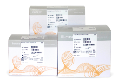
Figure 1: TruSeq Custom Amplicon Kit Dx — The FDA-regulated, CE-IVDmarked TruSeg Custom Amplicon Kit Dx provides library preparation reagents that allow clinical laboratories to develop their own diagnostic tests intended for use on Illumina Dx sequencing instruments.

With the TruSeq Custom Amplicon Kit Dx, clinical labs develop assays using custom-designed oligonucleotide probes. This customization gives users the flexibility to target specific regions of