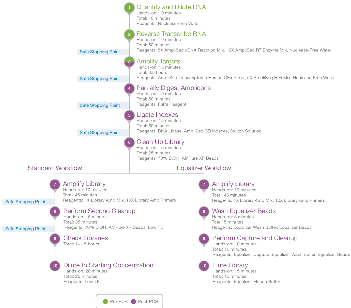
Figure 1 AmpliSeq Transcriptome Human Gene Expression Panel Workflow

The following diagram illustrates the AmpliSeq for Illumina Transcriptome Human Gene Expression Panel workflow. Safe stopping points are marked between steps.