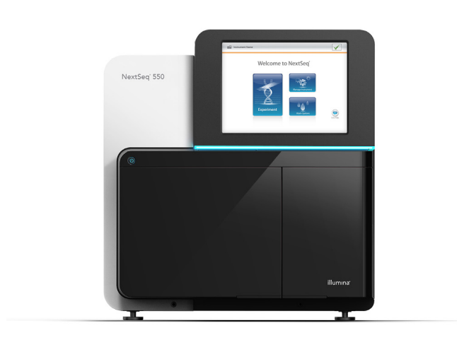
Figure 1: NextSeq 550 System—Proven platform offering the accuracy of SBS chemistry as part of a streamlined RNA-Seq workflow...

The NextSeg 550 RNA-Seg solution begins with RNA library preparation using Illumina Stranded Total RNA Prep, Illumina Stranded mRNA Prep, or Illumina RNA Prep with Enrichment.* Prepared libraries are loaded into a reagent cartridge and then onto the NextSeq 550 System for sequencing. The NextSeq 550 System features dual output